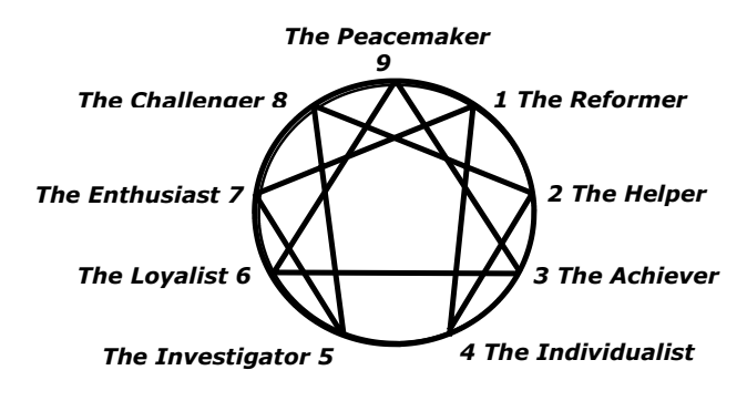
The Riso-Hudson Enneagram Type Names